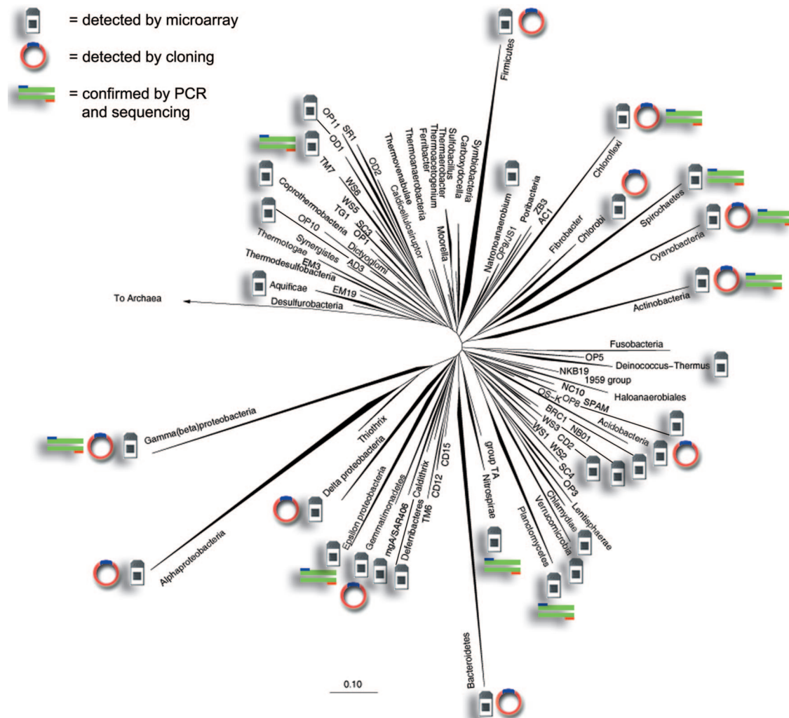
Fig. 1. Representative phylogenetic tree showing all known bacterial phyla (and individual classes in the case of proteobacteria) annotated to show 16S rRNA gene sequences detected in an urban aerosol by both microarray and cloning. Also annotated are phyla detected by microarray only that subsequently were confirmed by targeted PCR and sequencing. The Archaea are used as an outgroup. (Scale bar: 0.1 changes per nucleotide.)

three nonmatching bases so that the increased hybridization intensity signal of the PM over the paired MM indicates a sequence-specific, positive hybridization. By requiring multiple PM-MM probe pairs to have a positive interaction, we substantially increase the chance that the hybridization signal is due to a predicted target sequence.